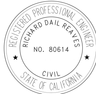
Civil Engineer's Stamp

*Flood Control Construction Cost Estimate to be provided by Flood Control District. Provide a copy of Flood Control District letter stating cost estimate.